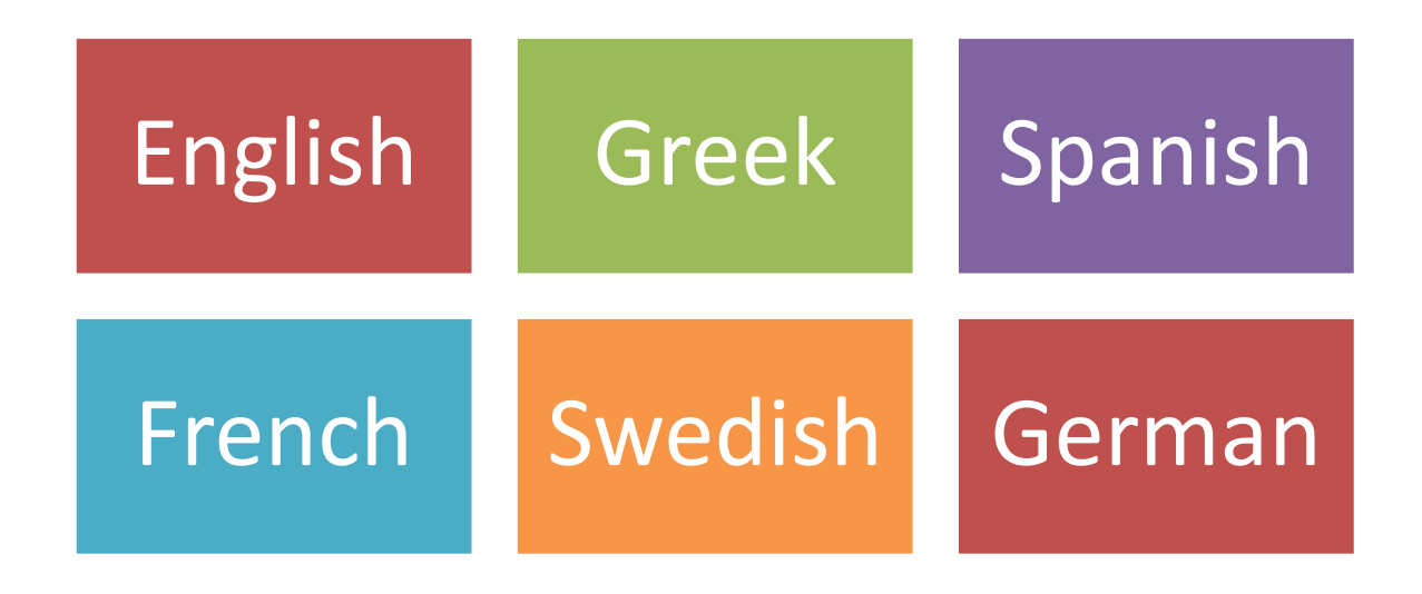
10 Intellectual Output [6] [MATE Online Platform, A2. Installation and Replication Platform]