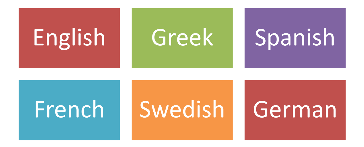
Module 5: Intercultural Communication